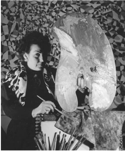
Fahrelnissa Zeid, Paris, early 1950s