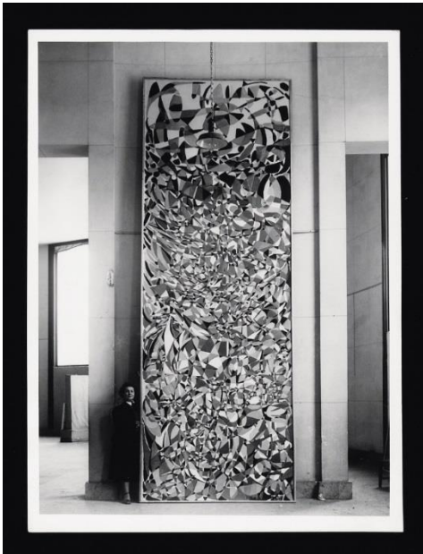
Fahrelnissa Zeid during the installation of Towards a Sky 1953 Musée des Beaux-Arts de la Ville de Paris, 1953